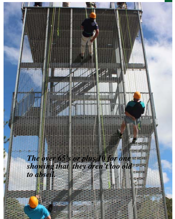
The over 65's or plus 10 for one showing that they aren't too old to abseil.