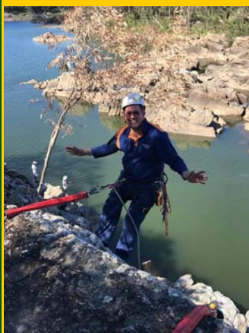
Drop Bear makes it look so easy (Nerves of steel)

19-20 August Annual Region Management Seminar