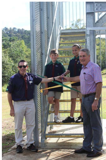
Cutting the Ribbon at Opening of Abseiling Tower