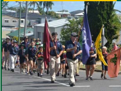
Calliope ANZAC PARADE