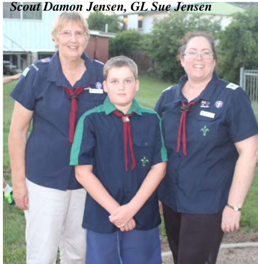
Bring a Friend Activity