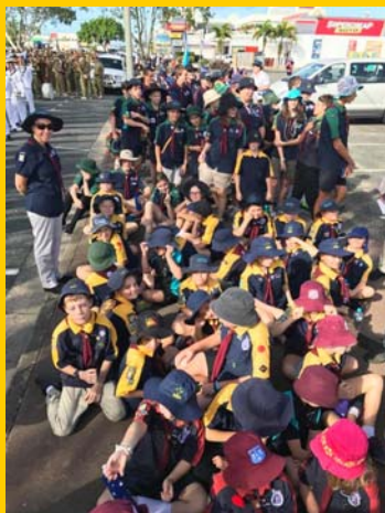
Mackay ANZAC Parade