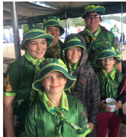
Sarina Cuboree Participants