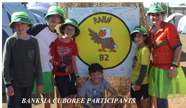
BANKSIA CUBOREE PARTICIPANTS