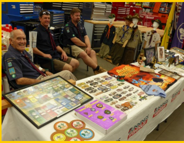
Memorabilia Display at Bunnings