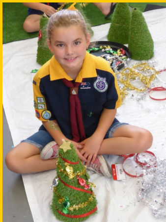
Bunnings Christmas Craft