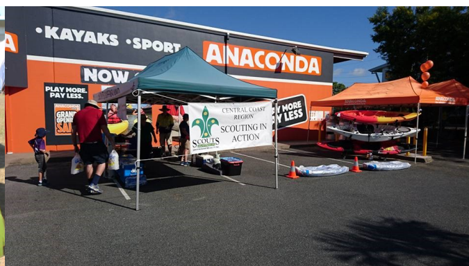
MT ARCHER GROUP AT ANACONDA