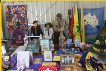
Memorabilia Display at Scoutfest