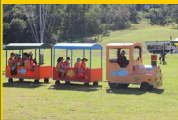
The very popular train at Scoutfest

DEADLINE FOR REGION NEWSLETTER 22ND NOV 2016