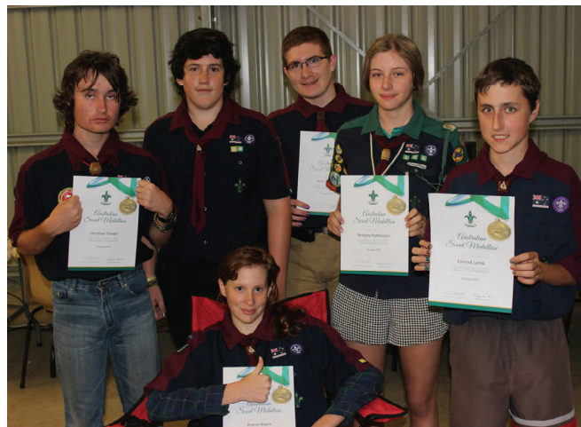
Australian Scout Medallion Certificate Presentation