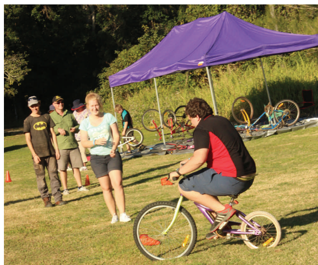
Venturer Scouts—Bike Bungle—Scoutfest