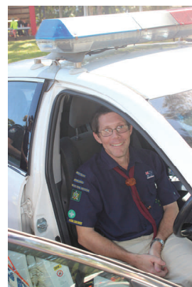
Let the Race Begin—Mountain Bikers